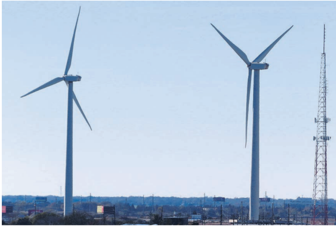
Land-based wind turbines spin in Atlantic City, N.J. on Nov. 3, 2023.

The strategy will use artificial intelligence and passive acoustic monitoring to determine where the whales are at a given time and to monitor the impacts of wind development on the animals. It also calls for